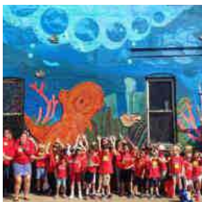
Portside Arts Center