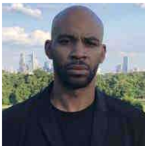
Acori Honzo Sculpture, Painting, African-American Dolls