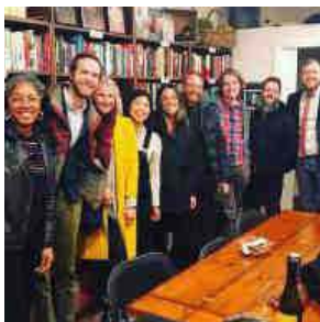
Blue Stoop Writing and Storytelling