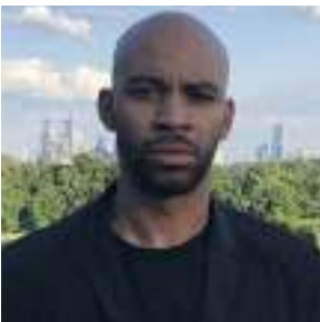
Acori Honzo Sculpture, Painting, African-American Dolls