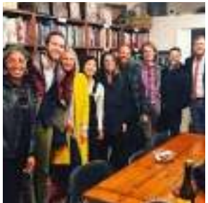
Blue Stoop Writing and Storytelling