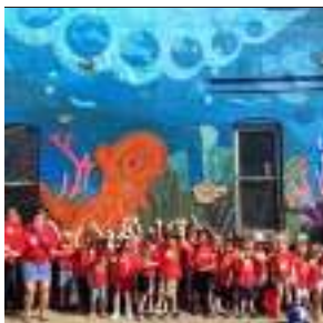
Portside Arts Center