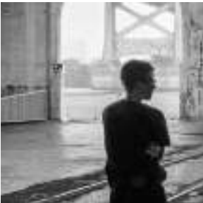
India Abbott Moving Image

A new group of talented artists have taken residence in Cherry Street Pier, including established arts collectives, emerging mixed media specialists, youth-focused art educators, and many, many more. Stop in to say hi, watch their creative process, and purchase their one-of-a-kind works of art.